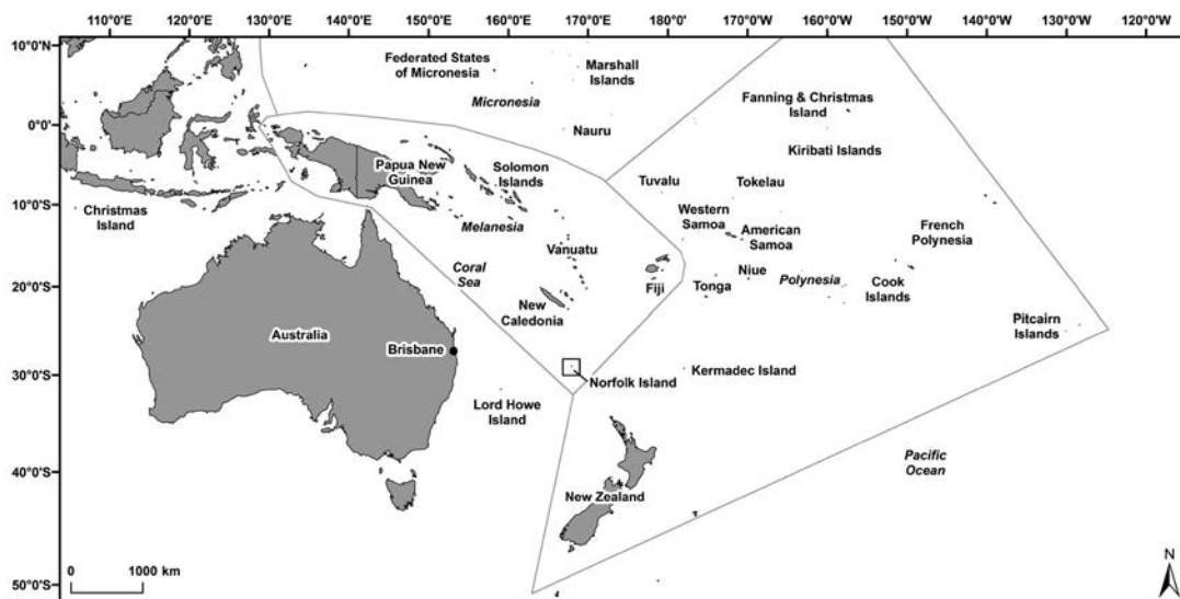
FIG. 1. Melanesian, Micronesian and Polynesian Island groups located north of Norfolk Island.

conducted. The published studies to date suggest the island supports a diverse mix of tropical and temperate species; a rich marine benthic algae assemblage comprising 236 species (Millar 1999); abundant and locally luxuriant assemblages of hermatypic corals (39 species) both inside the Kingston lagoon and elsewhere around the island group (Brook 1990), 254 coastal tropical and subtropical fish species (Francis 1993) and 60 tropical and temperate echinoderms (Hoggett & Rowe 1988; O'Hara 2008). Local fisherman also report patches of seagrass are present off the north west coast of Norfolk.